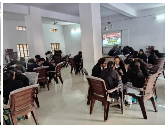
View of micro teaching in small groups of student teachers through Dialogue Method