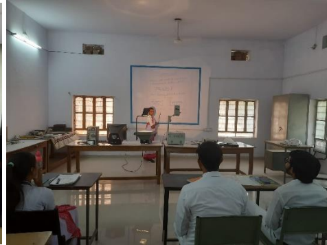
Student teachers participating in simulating teaching using OHP